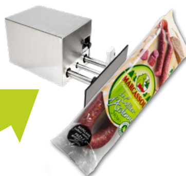
Rejection system (**)