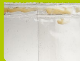
Product in seal