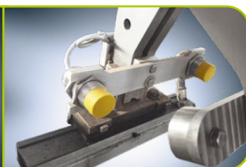
Sensors on sealing jaws