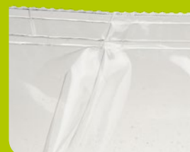
Wrinkles in seal