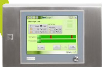
Controller cabinet with touchscreen user interface