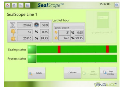
SealScope® operator view

SealScope® can use different reference models to accommodate changes in thickness, material, weight or size.