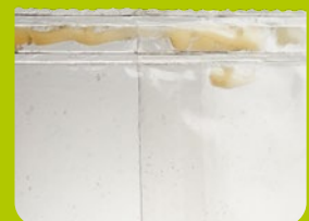
Product in seal