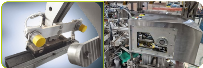
Sensors on /in sealing unit