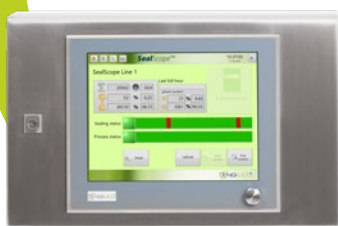
Controller cabinet with touchscreen user interface