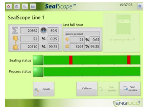
SealScope® operator view

SealScope® can use different reference models to accommodate changes in thickness, material, weight or size.