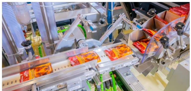
Leaking packages need to be avoided to prevent outgoing product quality issues and the soiling of packaging machinery.