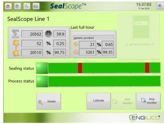
SealScope™ UI is operator-friendly and provides basic information on individual seals and the sealing process status.

"The non-destructive seal testing made directly on the sealing bars greatly improved our effective line efficiency from previous manual inspection methods." Octávio Sobéron explains, "Special Dog Company is delivering a 100% inspected product, which means satisfied consumers."