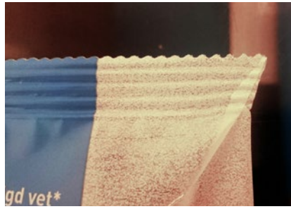
Wrinkles or folds in the seal can lead to leaks in the cheese package