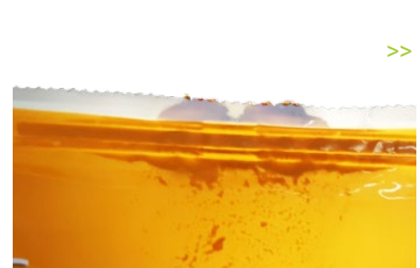
Dried fruit parts in the seal are retrieved in a package that is rejected by SealScope™