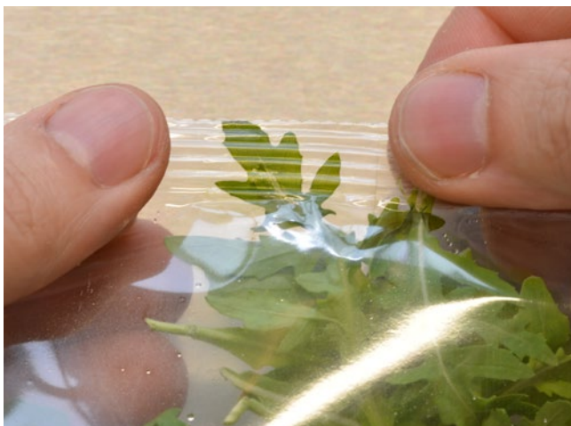
Product in seal causing leaking packages

Packaging fresh produce is typically done using vertical-form-fill-seal machines (VFFS) under modified atmosphere to preserve the freshness of the vegetables. Therefore, package integrity is important to warrant shelf life. A big challenge is the seal inspection of sliced vegetables, leafy greens or salads. Because these products are lightweight, they swirl during the filling and tend -as they are often wet- to stick to the inner bag sides. Also, as the filling is not 100% controlled, it often occurs that the seal bars are already closing when the last leaves are falling. Because the leaves are light, they are often completely crushed due to the pressure of the sealing.