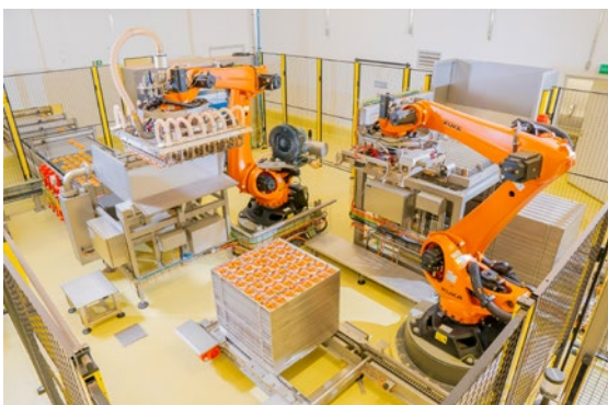
SealScope™ in-line seal inspection is perfectly suited in highly automated packaging environments

Special Dog Company, a Brazilian pet food producer has opted for SealScope™ on their Toyo Jidoki rotating pouch packaging line. The automated, 100% seal inspection leads to immediate benefits: Every single package is inspected, so manual inspection can be reduced or drastically reduced. By rejecting the defective packages, the outgoing quality is instantly increasing.