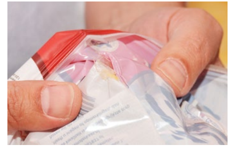
Cheese parts in the seal are retrieved in a package that is rejected by SealScope™

residual packaging defects, optimizing the outgoing packaging quality. Typical rejects include cheese trays partially stuck in the seal, product in seal or wrinkles. The sensitivity of the rejection level can be set according to the customer's quality policy to find the right balance between outgoing quality, packaging speed and rejected packages.